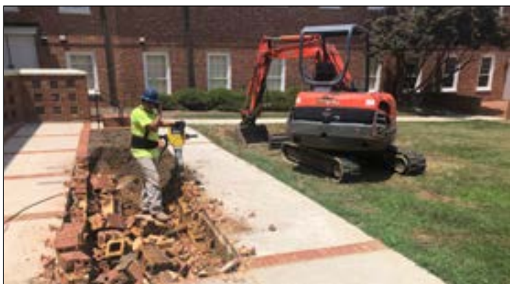
A worker jackhammers the flowerbed in the Memorial Garden to make way for new niches.

Meanwhile the Property Committee continues to move forward with upgrades in Westminster Hall. The hall