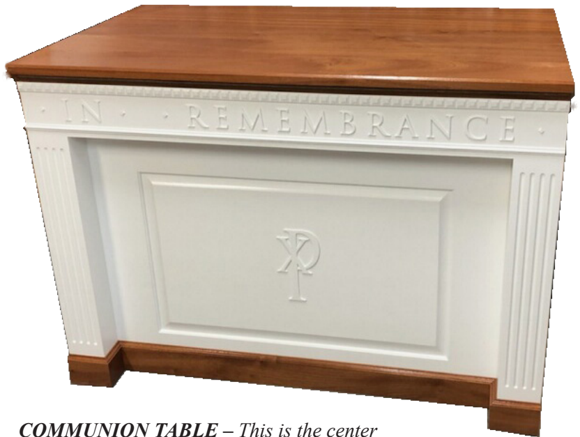
COMMUNION TABLE – This is the center section of the new table after it was stained and painted.

I knew the tables would be well used and loved. I also was drawn to the challenge of turning a 12 foot table into smaller parts that could be utilized both together and on their own.