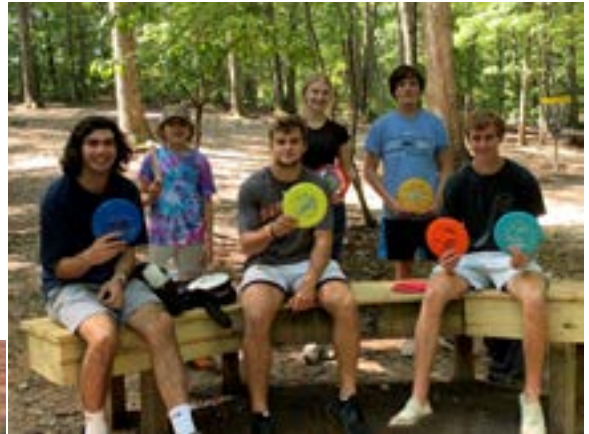
Enjoying Disc Golf